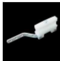
Heavy duty stage master carrier