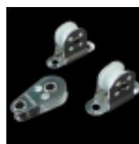
Three piece pulley set