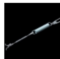
Tension system with heavy duty spring and 4mm cord